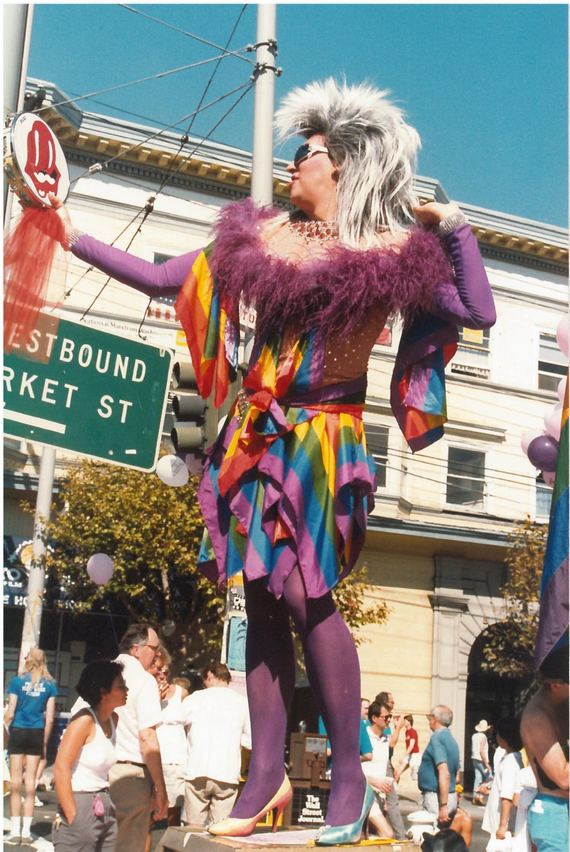
Gilbert Baker posing in a rainbow dress with a Rolling Stones tambourine during the 1987 Castro Street Fair