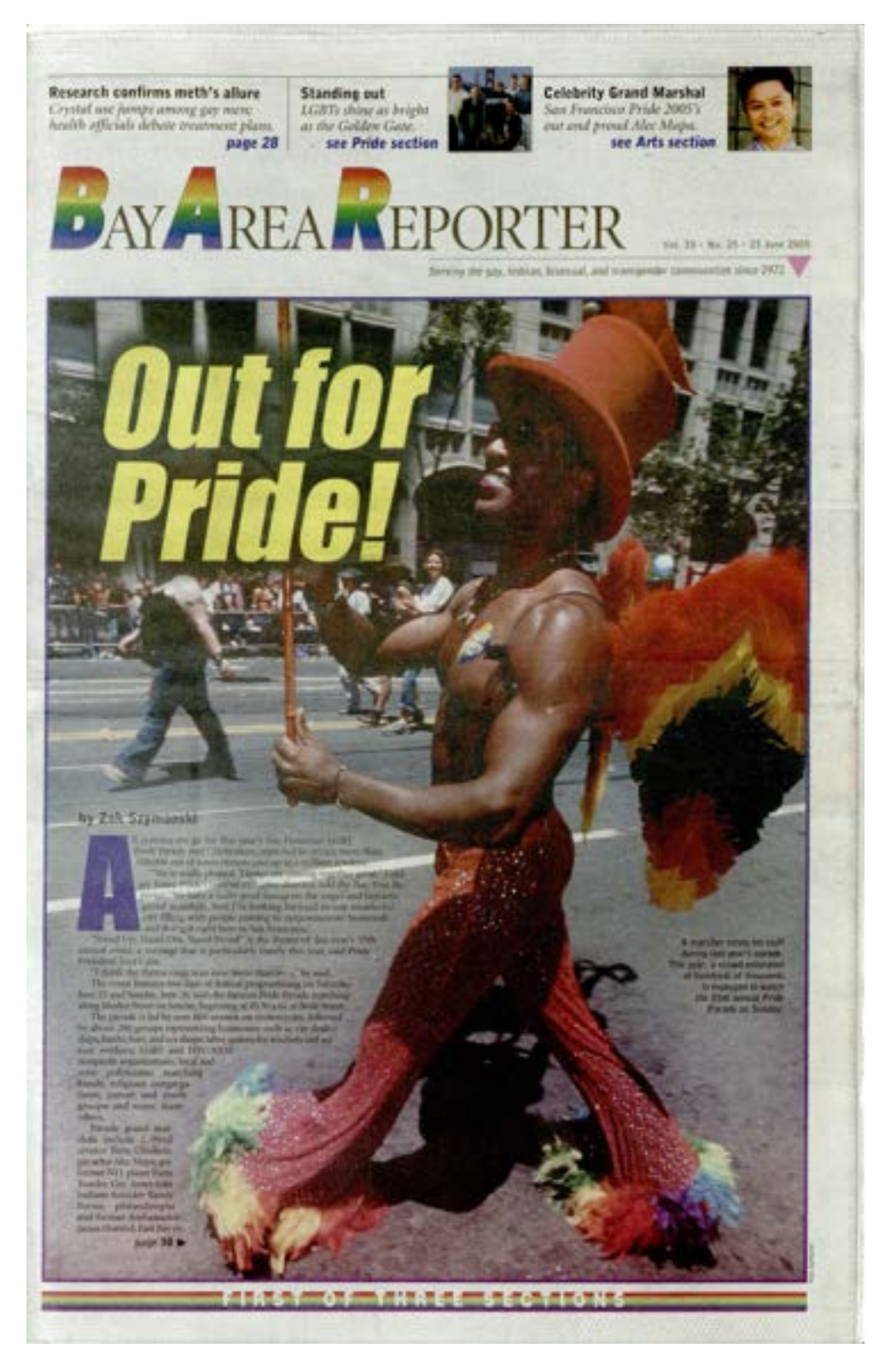
A colorful 2005 Pride issue of the Bay Area Reporter ; Vol. 35 No. 25, June 23, 2005; Periodicals Collection, GLBT Historical Society, copyright BAR Media, Inc.

The GLBT Historical Society (415) 777-5455 | info@glbthistory.org | www.glbthistory.org 989 Market Street, Lower Level