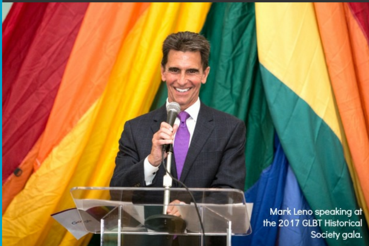
Mark Leno speaking at the 2017 GLBT Historical Society gala.

From the Development Director In the Archives Upcoming Events Visit Us