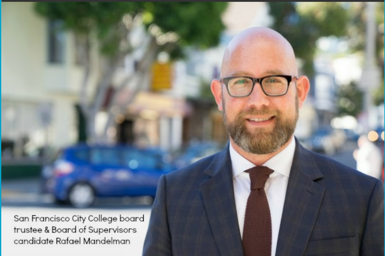
San Francisco City College board trustee & Board of Supervisors candidate Rafael Mandelman

From the Staff In the Archives Upcoming Events Visit Us